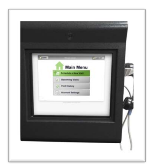
FIGURE 2: VIDEO VISITING KIOSK

A standards-based system is the most versatile and connects to any other standards-based video conferencing system. A non-standards-based system that only connects to identical systems is limiting. For example, cell phones that only connect with the same cell phone brand are not as useful as cell phones that can call all other cell phone brands. A standards-based system allows for connections to other state, local, and community-based agencies with standards-based systems. If the video conferencing system is connecting to multiple sites, explore if licensing fees (for equipment and/or software) will be charged for each site.