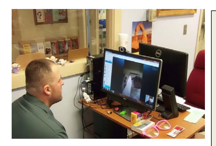
Figure 6 NH DOC's Family Connections Center Video Visiting Program

Video visiting is also an alternative for children who had a negative experience travelling to or visiting at the facility. Researchers theorize that correctional visiting environments that are not child-friendly may account for children's negative reactions to visiting, underscoring the necessity for child-friendly visiting policies. <sup>99</sup>As such, correctional agencies could explore how best to ensure that children are treated sensitively when they visit in-person, while also offering video visiting in a supportive setting as a child-friendly supplement to in-person visits.