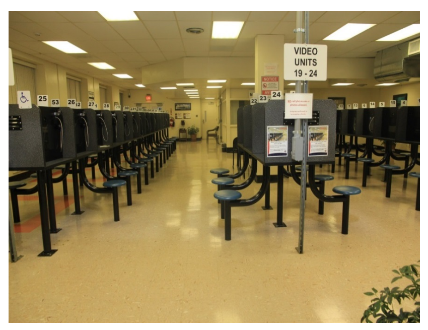
FIGURE 3: VIDEO VISITING AREA FOR VISITORS AT THE D.C. JAIL

Know what operating system is installed on the unit, and determine how often the operating system requires updating. Identify how the updates will be performed and who is responsible (correctional IT or contracted company). This is important because operating systems that require constant updates (e.g., Windows-based operating systems) may increase costs. Some operating systems have inhibitors to block updates, and some operating systems update automatically. (See Appendix 2A-4: Choosing a Video Visiting System, for a checklist of considerations)